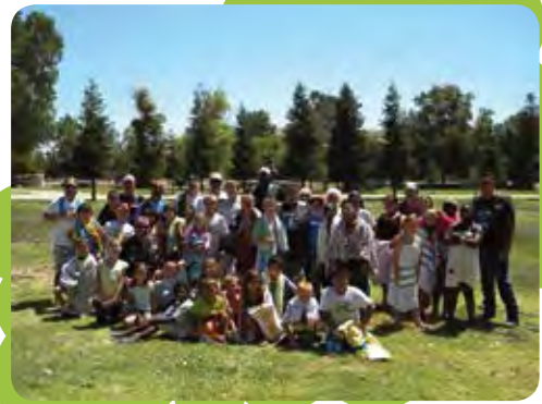
Bakersfield Kids Camp attendees with members of the Porterville American Legion Riders – Chapter 20. Each year the Legion Riders raise funds to support Kids Camp. In 2013 they raised $4,500 at their Annual Ride For Awareness Poker Run.

Camp time is about honest talk. They don’t need to be worried about upsetting their